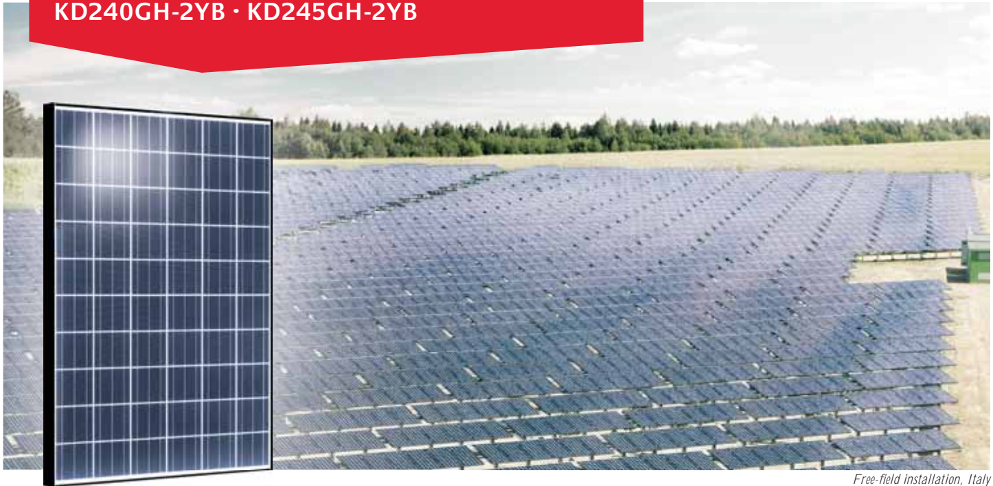
Free-field installation, Italy