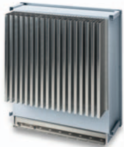
Extremely rugged: SINVERT PVM inverters do not have external fans.